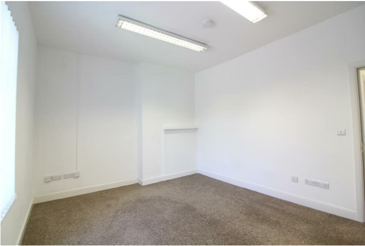
MAIN OFFICE 14'1" x 11'3" approx