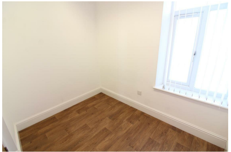
KITCHEN AREA 5'6" x 5'0" approx