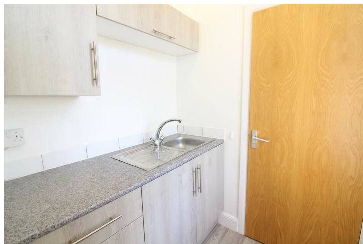
SHOWER ROOM 5'6" x 5'4" approx